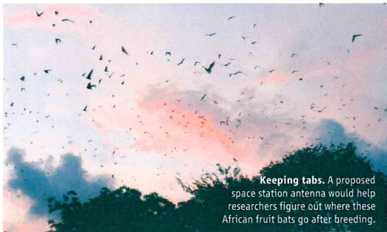
Keeping tabs. A proposed space station antenna would help researchers figure out where these African fruit bats go after breeding.

an antenna on the space station for ICARUS, as the project is called. If all goes well, he says, by the end of 2014, the antenna will be tracking about 1000 small animals, with the potential to follow thousands more, enabling him and collaborators to assess how the creatures spend their lives and where they die.